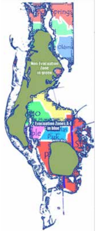
The olive green areas of this map show locations in Pinellas County high enough to withstand storm surge. The star is Bay Ranch.

Evacuating to a shelter within the county has its advantages. You can avoid traffic jams and the uncertainty that comes with driving the crowded highways as other counties evacuate along with Pinellas.